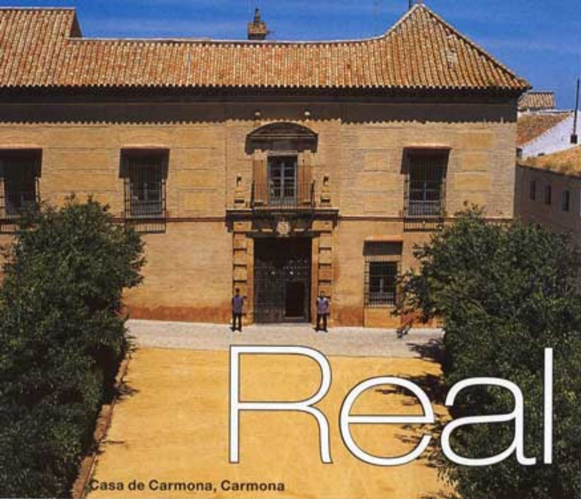
Casa de Carmona, Carmona

Just off the beaten track there are destinations low on crowds yet high on style – and at every price level