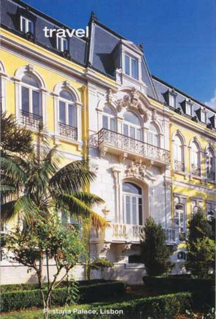
Pestana Palace, Lisbon