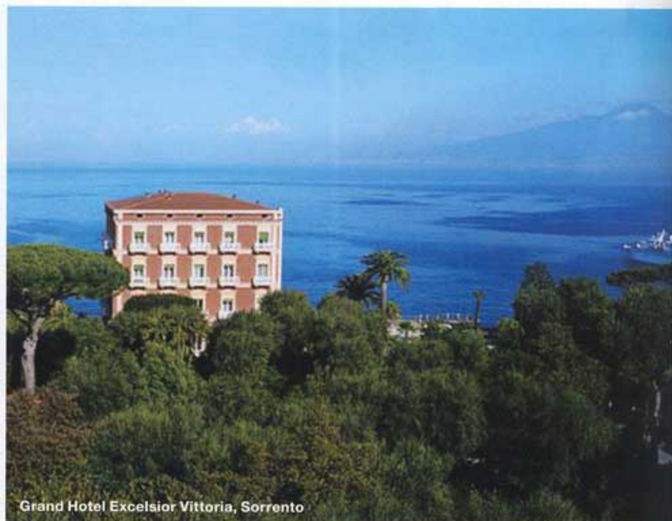
Grand Hotel Excelsior Vittoria, Sorrento

which incorporates Gothic and Moorish architectural styles. The rooms are spacious but cosy and peacocks have the run of the grounds, which feature a pool and mini amphitheatre. The don't-miss dish here is cod cooked with herbs fresh from the garden and the wines are excellent, too – nearby is Vidigueira, home to Portugal's finest vineyards. And do go to the nearby historical town of Beja to pick up some souvenirs, made from local hand-turned wood, iron, cork and pottery.