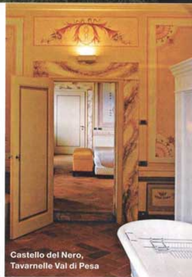
Castello del Nero, Tavarnelle Val di Pesa

Fifty years ago, movie legends such as Jack Lemmon and Sophia Loren , far left , holidayed at the hotel and it still has a