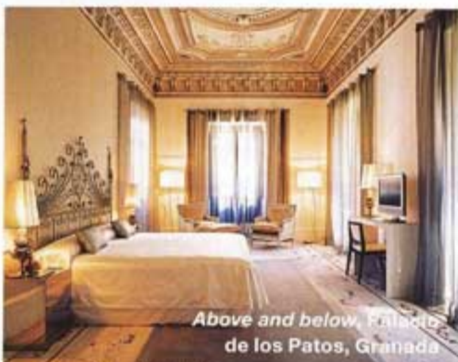
Above and below, Palacio de los Patos, Granada

Equally palatial, yet more traditional in style, is Casa de Carmona in the hilltop town of Carmona, 25km east of Seville. The hotel, which dates back to the 16th century, has pretty, individually decorated bedrooms perfect for that all-important